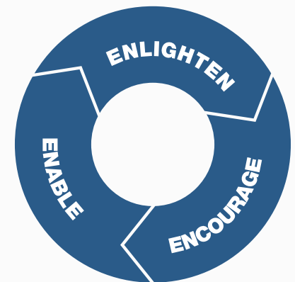
The Three Necessary Conditions for Initiating and Sustaining Successful Behavioral Change

Talent Accelerator is available with any Envisia Learning assessment – including those that are custom designed just for you. Before you buy any 360-degree assessment, be sure to learn more about how Talent Accelerator translates insight into increased effectiveness and greater ROI for your program. Just visit our website at www.envisialearning.com .